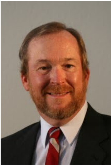
Erik Smitt, candidate for Congress

The social hour starts at 6:30 PM and the general meeting starts at 7:15 PM.